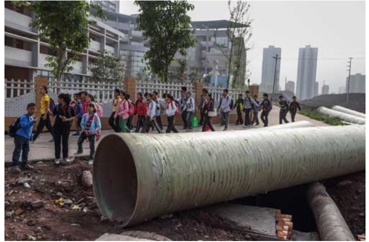
Children walked to school from a housing project in Chongqing, where their families were resettled after leaving their farmland.